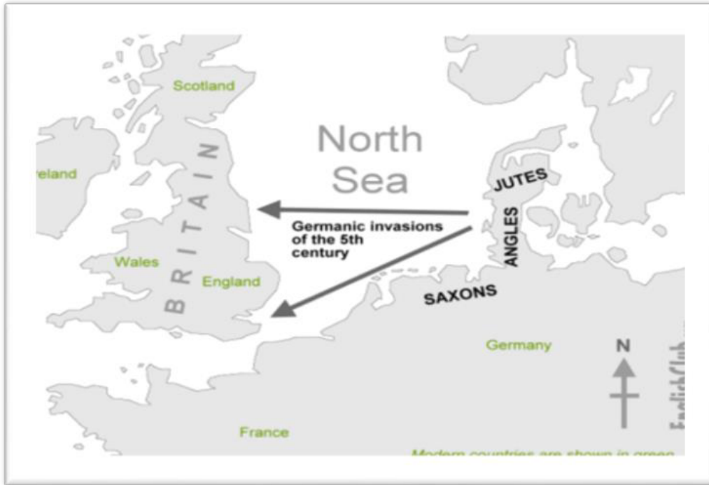
Figure 1: Entering of Germanic invaders to Britain on the east and south coasts in the 5th century

English language has undergone substantial changes through time from its inception and a brief analysis of the timeline of history of English reveals that it is traditionally divided into four periods.