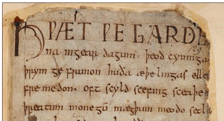
Figure 2: Part of the Cotton MS Vitellius A XV manuscript currently located within the British Library.

commonly used words in Modern English have Old English roots. The words be , strong and water , for example, derive from Old English. Some words that are derived from Old English are: axode (asked), habba (have), rihtlice (rightly), engla (angels), heofonum (heaven), swilcum (such), hu (how) and beon (be). Old English was spoken from 450 AD until around 1100 AD. Figure 2 depicts a part of the first folio of the heroic epic poem Beowulf , written primarily in the West Saxon dialect of Old English.