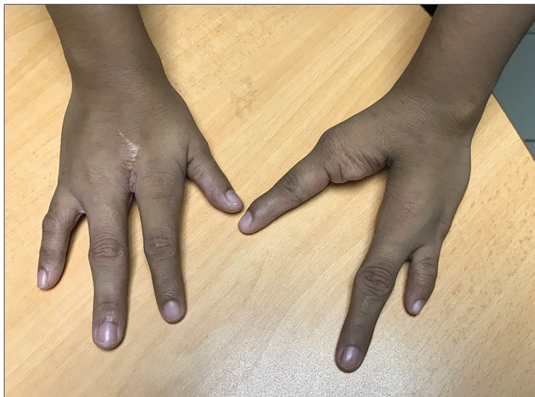
Fig. 3 Clinical photographs of the hands of the mother showing bilateral ectrodactyly involving both hands, with the absence of the third digit on the right hand and two digits on the left hand, with bi-phalangeal left 5th digit