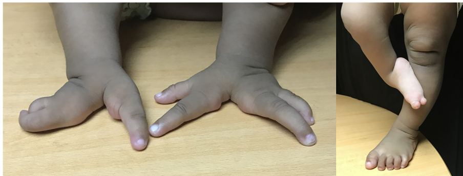
Fig. 1 Clinical photographs of the hands and the feet of the proband showing ectrodactyly involving three limbs, with the absence of the third digit on the left hand, absence of 2 digits on the right hand with malformed fingers (except the thumb) and the fixed clubfoot deformity with only 2 toes on the right foot

At the time of reporting, the baby was 10 months of age. Her body weight was 7.95 kg (25th centile), length was 72 cm (above 50th centile) and head circumference was 44 cm (between 25th and 50th centile). She had age-appropriate developmental milestones. Hearing and visual assessments were normal. Repeat ultrasonography of the brain and the abdomen showed no abnormalities.