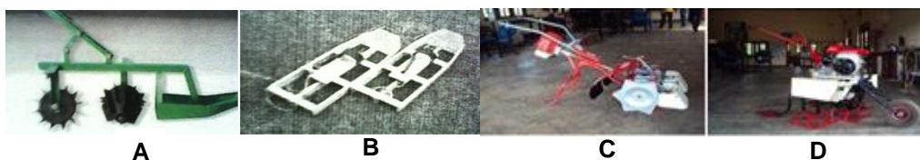
Figure 1. Equipment Used in Weeding Operation.

light wood and piano wire, respectively. The third equipment is a rotary power weeder having a working width of 36 cm and two rows of paddy can be covered at a time during a single pass. The weeding spike of the rotor is made up of MS sheet and the rotor of the weeder is made up of an aluminum sheet. Fourth equipment is the newly designed burial type lowland power cultivator having a 90 cm working width and three rows of paddy can be covered at a time in a single pass. Three weeding clogs were made form MS flat iron and rods. Beside, manual method of weeding, a very common practice, was used as the control for this experiment. Figure 1 shows different equipment used in weeding operation.