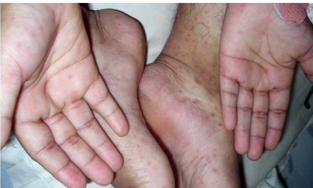
Figure 5. Discrete erythematous maculopapular rash involving palms and soles in SFG rickettsial infections.

For the IFA assays we used antigens of R. conorii , a member of the SFG rickettsiae, prevalent in southern Europe, in many parts of Africa, and in Asia. However, this organism has a wide antigenic