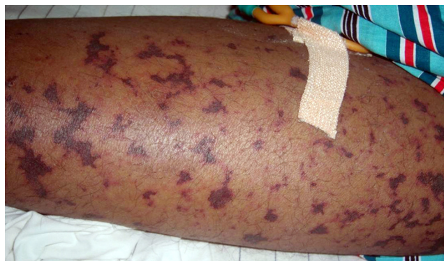
Figure 3. Severe vasculitis with fern leaf type skin necrosis in a spotted fever patient.

Of the 105 patients who were serologically positive for Rickettsia IgG antibodies, 53/105 (50.5%) were male and 52/105 (49.5%) were female, and their mean age was 40 years (range 11–83 years). Most of the clinical features were common to all of the patients ( Table 3 ). In the SFG infection patients, 13/55 (24%) had life-threatening severe vasculitis with fern leaf type skin necrosis ( Figure 3 ) and 17/55 (31%) had arthritis ( Figure 4 ). Three patients (5%) had altered levels of consciousness. These patients required administration of intravenous corticosteroids in addition to intravenous chloramphenicol for clinical recovery. Scrub typhus infections were mild, but one patient had transient deafness. None of the 105 patients had eschars, but 14/55 (25%) SFG patients had a history of tick bite prior to the onset of fever. Thirty-nine SFG