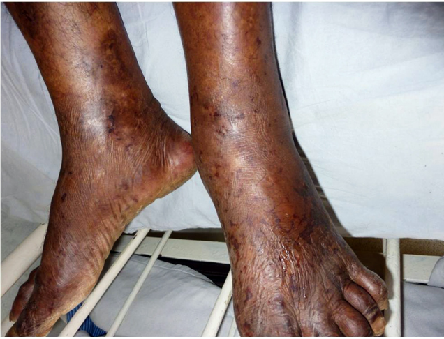
Figure 4. Acute arthritis involving ankle joints in spotted fever.

patients (71%) had a maculopapular rash distributed mainly on the limbs, including palms and soles (Figure 5, Table 3). Of the clinical cases for whom IFA assays were not done, three died of their illness due to a delay in diagnosis and in starting appropriate treatment. All three had extensive vasculitis with fern leaf skin necrosis and later developed irreversible multi-organ failure. The patient with murine typhus had a milder form of infection, but had transient confusion. Of the serologically confirmed group (Table 3), 43/63 (68%) had fever and a skin rash, 62/63 (98%) had fever with a response to antibiotic treatment, and 44/63 (70%) had a skin rash with a response to antibiotic treatment.