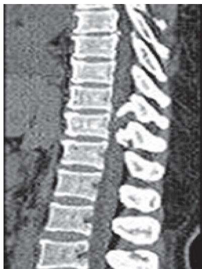
FIGURE 3: CT thoracic spine shows T10-T11 vertebral body and disc regeneration.

Enterobacter agglomerans is in family Enterobacteriaceae. It causes opportunistic human infections, mostly as wound infection following contamination of plant material and as hospital-acquired infections [12]. While in ward, this lady presented with sudden onset paraparesis. The sudden onset nature is leaning towards being pyogenic in origin. Tuberculous spondylodiscitis is commonly subacute in onset. Usually 46% of cases of pyogenic spondylodiscitis and only 17% of tuberculous spondylodiscitis have fever as a complaint [13]. Throughout this period, this lady was afebrile.